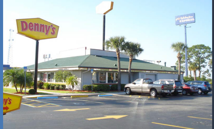
Excellent Street Signage